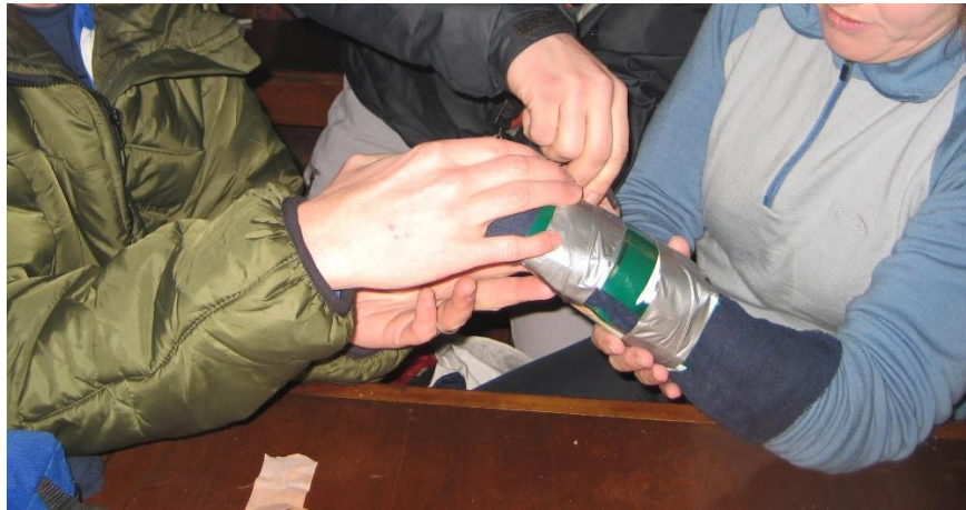
Figure ? – Acknowledge photographs if taken by someone else